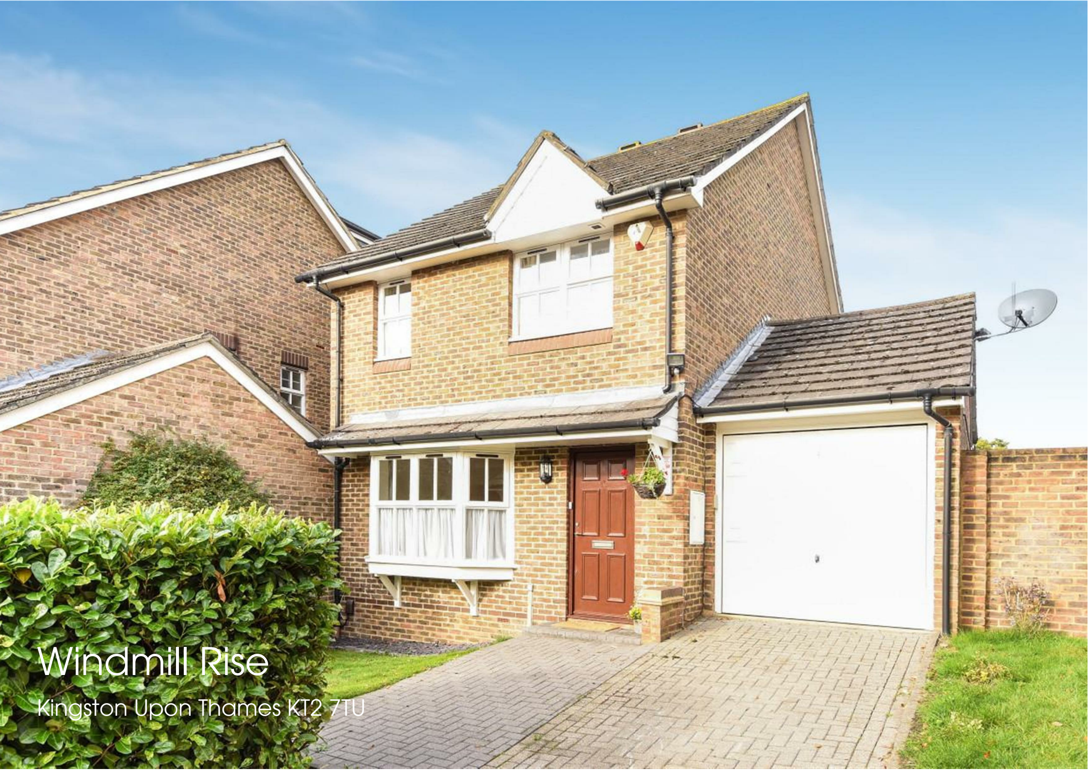
Windmill Rise Kingston Upon Thames KT2 7TU